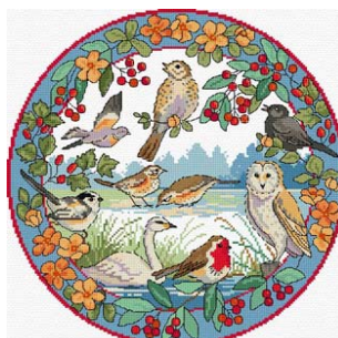
Birds in Winter