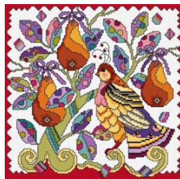
A Partridge in a Pear Tree