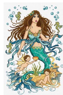
Mermaid & Water Nymphs