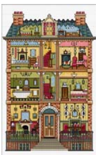
Victorian Dolls House