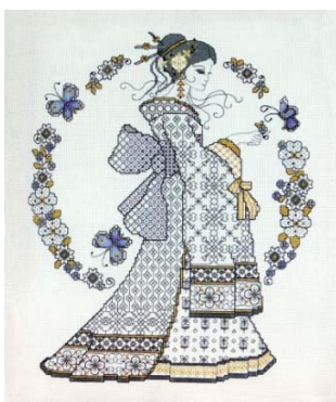
Blackwork Oriental Beauty