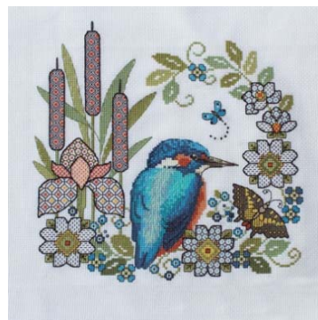
Blackwork Iris and Kingfisher