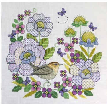
Blackwork Scabious & Wren