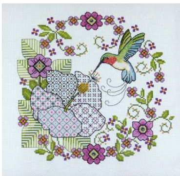
Hibiscus and Hummingbird