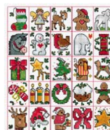
25 Christmas Tag motifs

View these patterns and many more on Creative Poppy's website