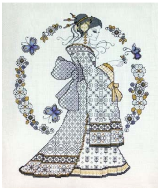
Blackwork Oriental Beauty