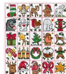
25 Christmas Tag motifs

View these patterns and many more on Creative Poppy's website