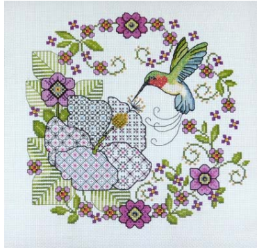
Hibiscus and Hummingbird