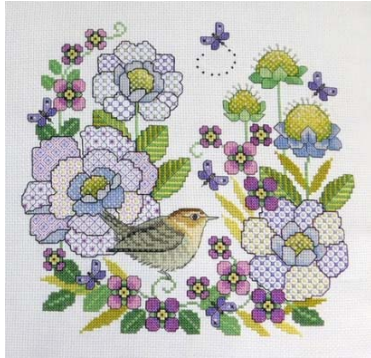
Blackwork Scabious & Wren