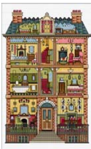
Victorian Dolls House