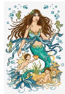
Mermaid & Water Nymphs