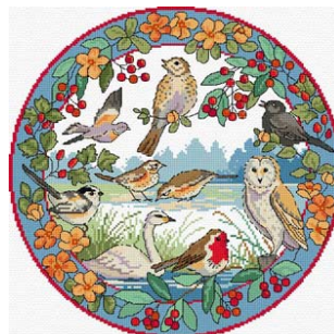
Birds in Winter