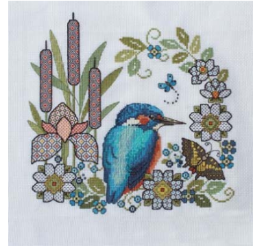
Blackwork Iris and Kingfisher