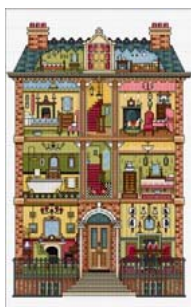
Victorian Dolls House