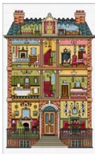
Victorian Dolls House