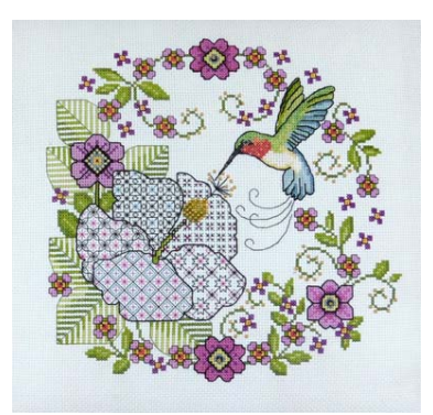
Hibiscus and Hummingbird