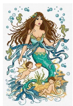
Mermaid & Water Nymphs