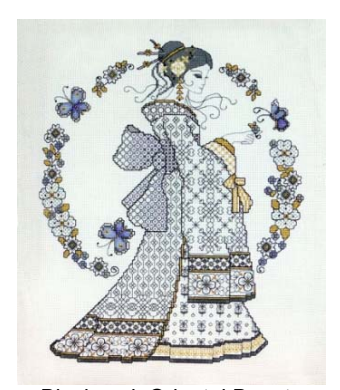
Blackwork Oriental Beauty