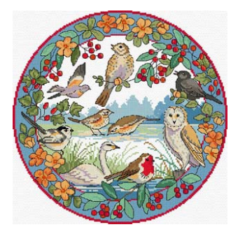
Birds in Winter