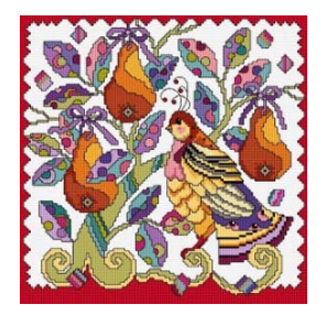
A Partridge in a Pear Tree