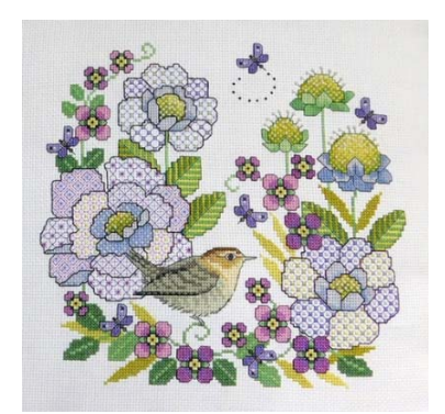
Blackwork Scabious & Wren