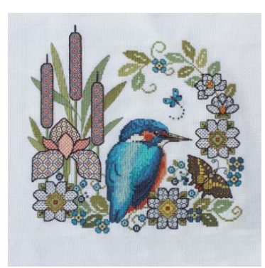
Blackwork Iris and Kingfisher