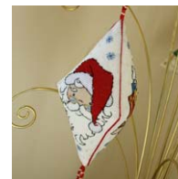
Papa Noël pendant

Designs by Faby Reilly Published by Creative Poppy