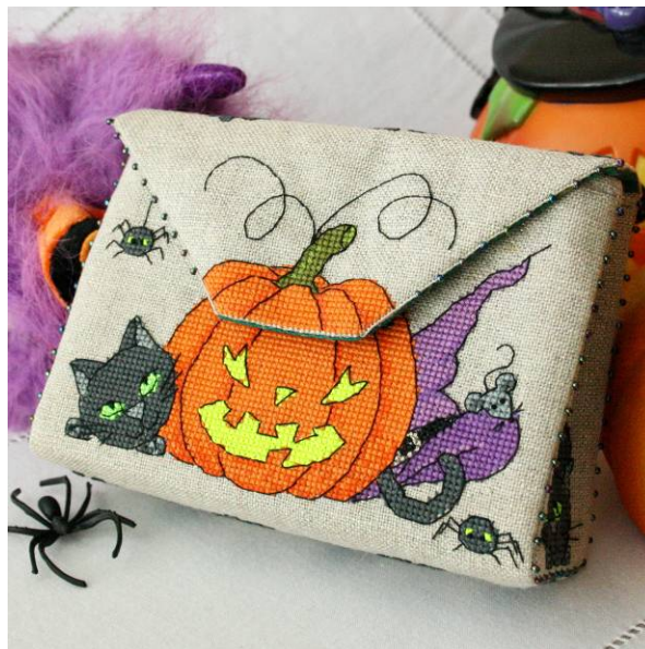
Halloween Purse – cross stitch pattern designed by Faby Reilly

You can then stitch each pair of opposite backstitches together, as shown on the picture.