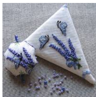
Lavender Bouquet Scissor Case

If you enjoyed stitching this needlebook, you may like the following designs: