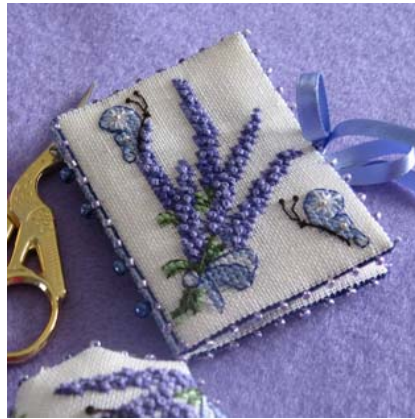
Lavender Bouquet Needlebook designed by Faby Reilly

You can then stitch each pair of opposite backstitches together, as shown on the picture.