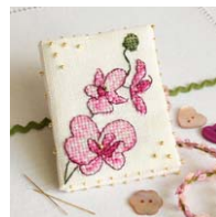
Plum orchid Needlebook