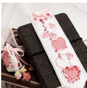
Sweet Heart Bookmark and Key Fob