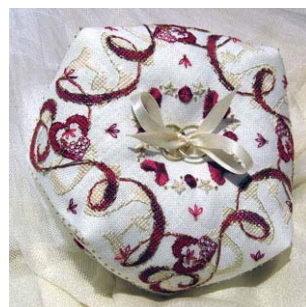
Love Wedding Ring Cushion