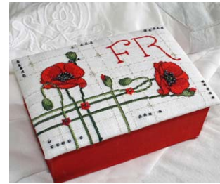
Poppy Box & Alphabet