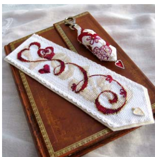
Love Bookmark and Key Fob