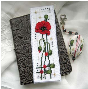
Poppy Bookmark and Key Fob