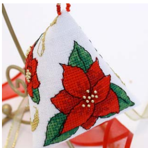
Poinsettia & Ribbon Humbug