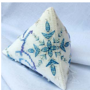
Frosty Snowflake Humbug