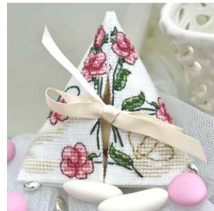
Sweet Roses Humbug