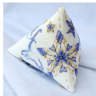
Frosty Star Humbug

View these patterns and many more on Creative Poppy's website