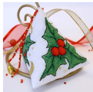
Holly & Ribbon Humbug