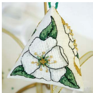
Christmas Rose & Ribbon