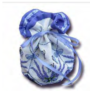
Lavender Bouquet Pouch