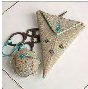
Butterfly Scissor Case