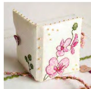
Plum Orchid Needlecase