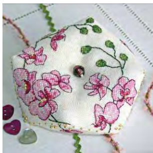
Plum orchid Biscornu