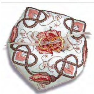
Sepia Rose Biscornu