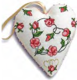
Sweet Roses Heart