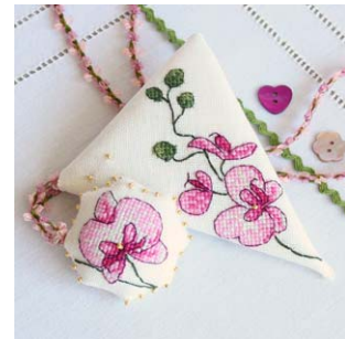
Plum Orchid Scissor Case