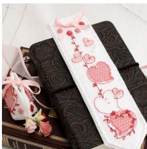
Sweet Heart Bookmark and Key Fob