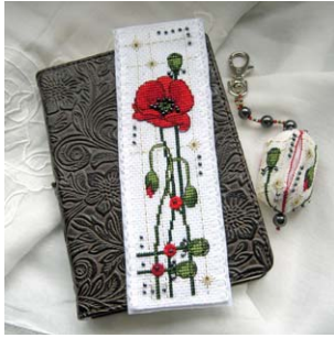
Poppy Bookmark and Key Fob