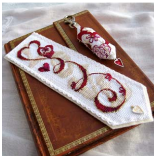
Love Bookmark and Key Fob