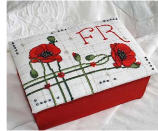
Poppy Box & Alphabet