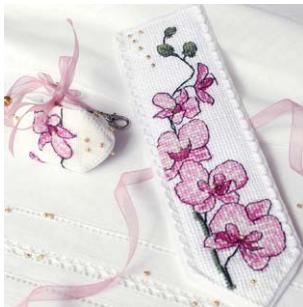
Plum Orchid Bookmark and Key Fob