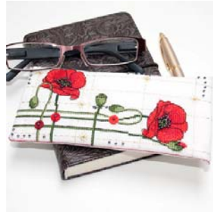
Poppy Glasses Case