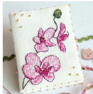
Plum Orchid Needlebook