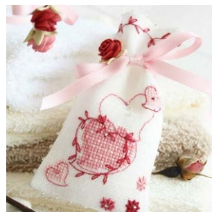
Sweet Heart Sachets