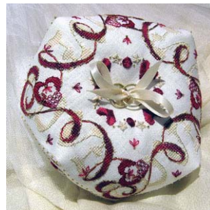
Love Wedding Ring Cushion