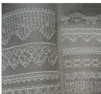
Lace border sampler