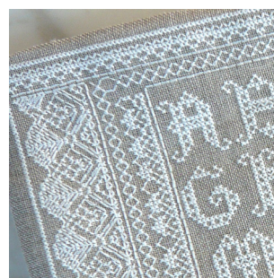
Lace alphabet sampler